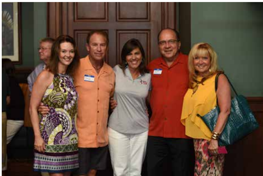
Johnny Bench and Doug Flynn with Hope For The Warriors guests and volunteer.